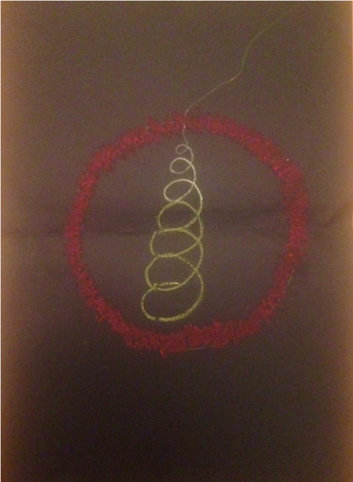
Figure 3. Tova's mandala