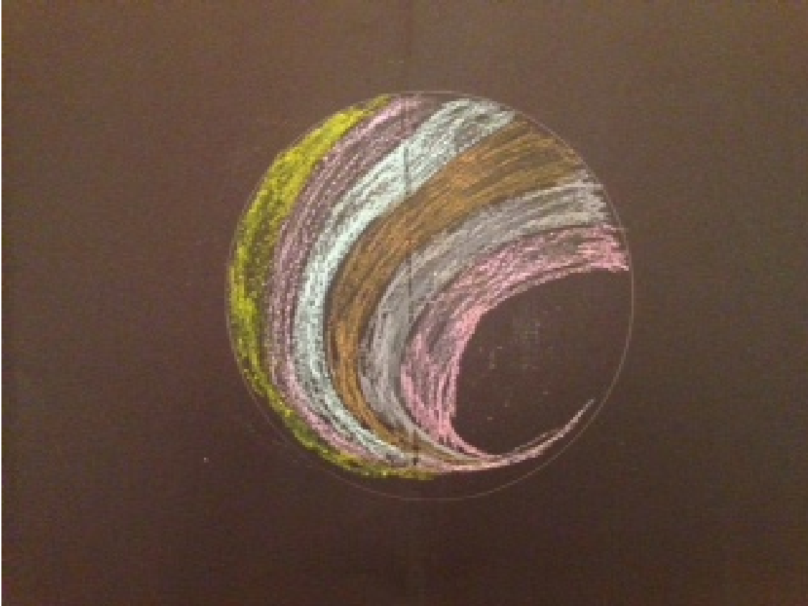
Figure 1. Barbara's mandala

The participants drew in silence, taking about 10-15 minutes. Afterward they shared what stood out to them about their mandalas. The mandalas are shown below in Figures 1-3.